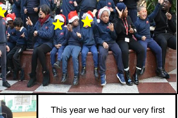
This year we had our very first Winter Wonderland where children and their families were able to create some Christmas crafts together in a relaxed and supportive environment. We have had some lovely feedback from you all about the day so will definitely be one that we add to our calendar.