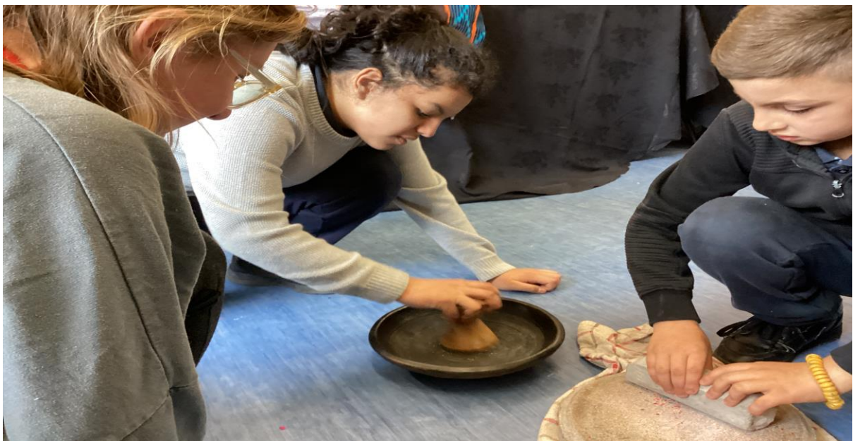
I am grinding some rice using an earthen dish and a wooden pestle