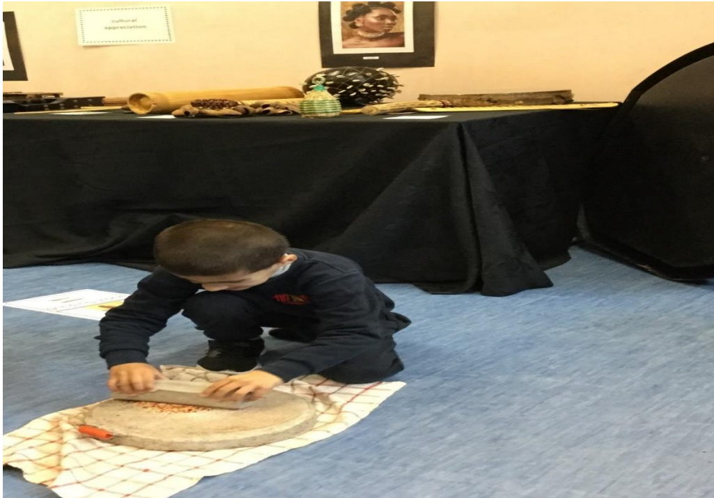
I enjoy grinding rice using a stone grinder