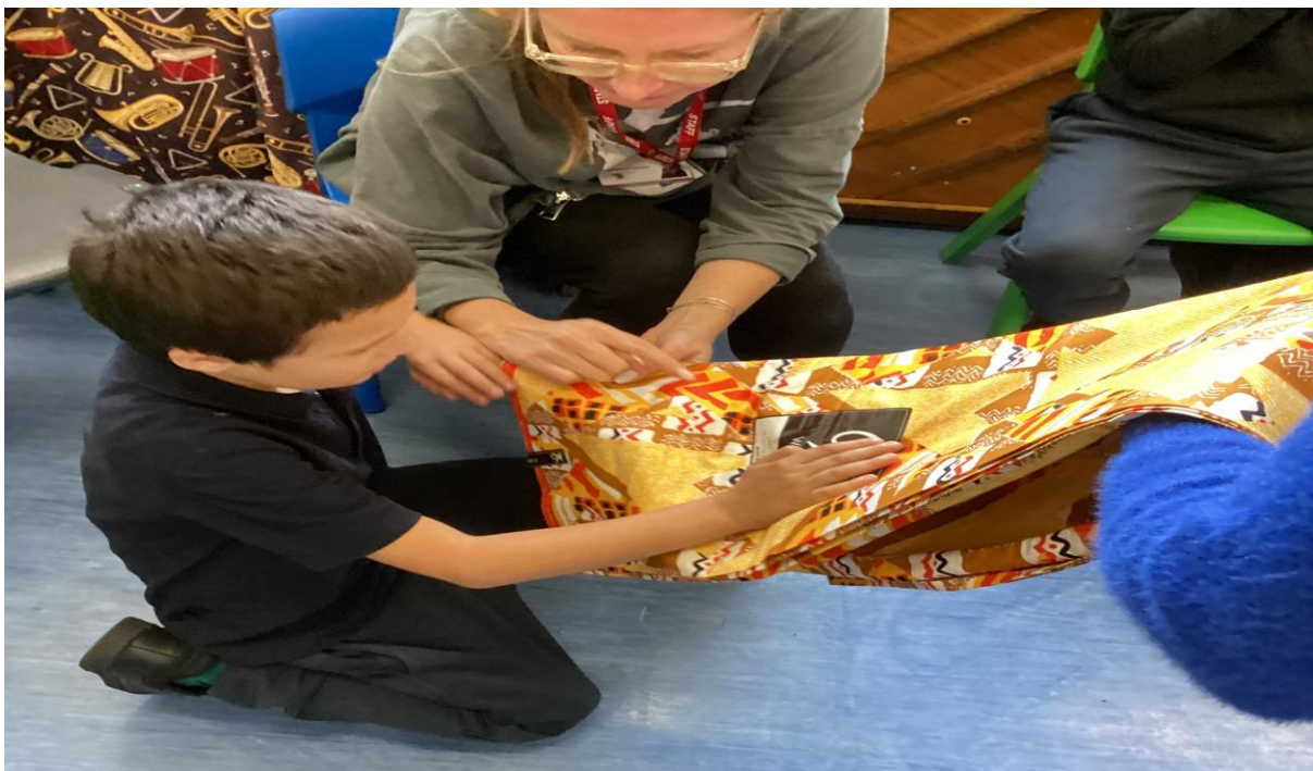
I am exploring an African print fabric: African Ankara print