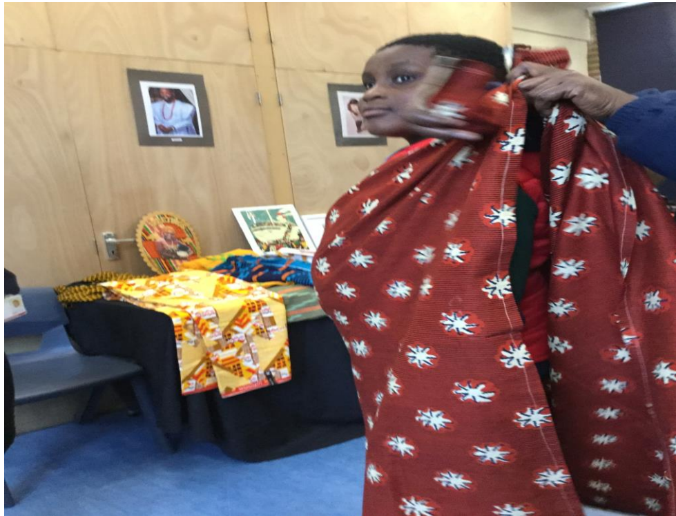
I enjoy dressing up