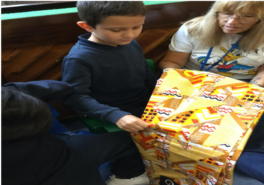
I am exploring an African print fabric (exploring texture)