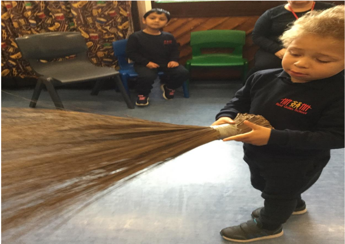
I am holding a traditional African broom