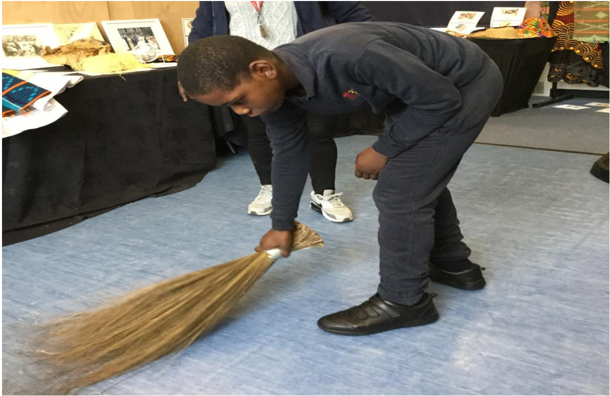
I am sweeping the floor using an African broom