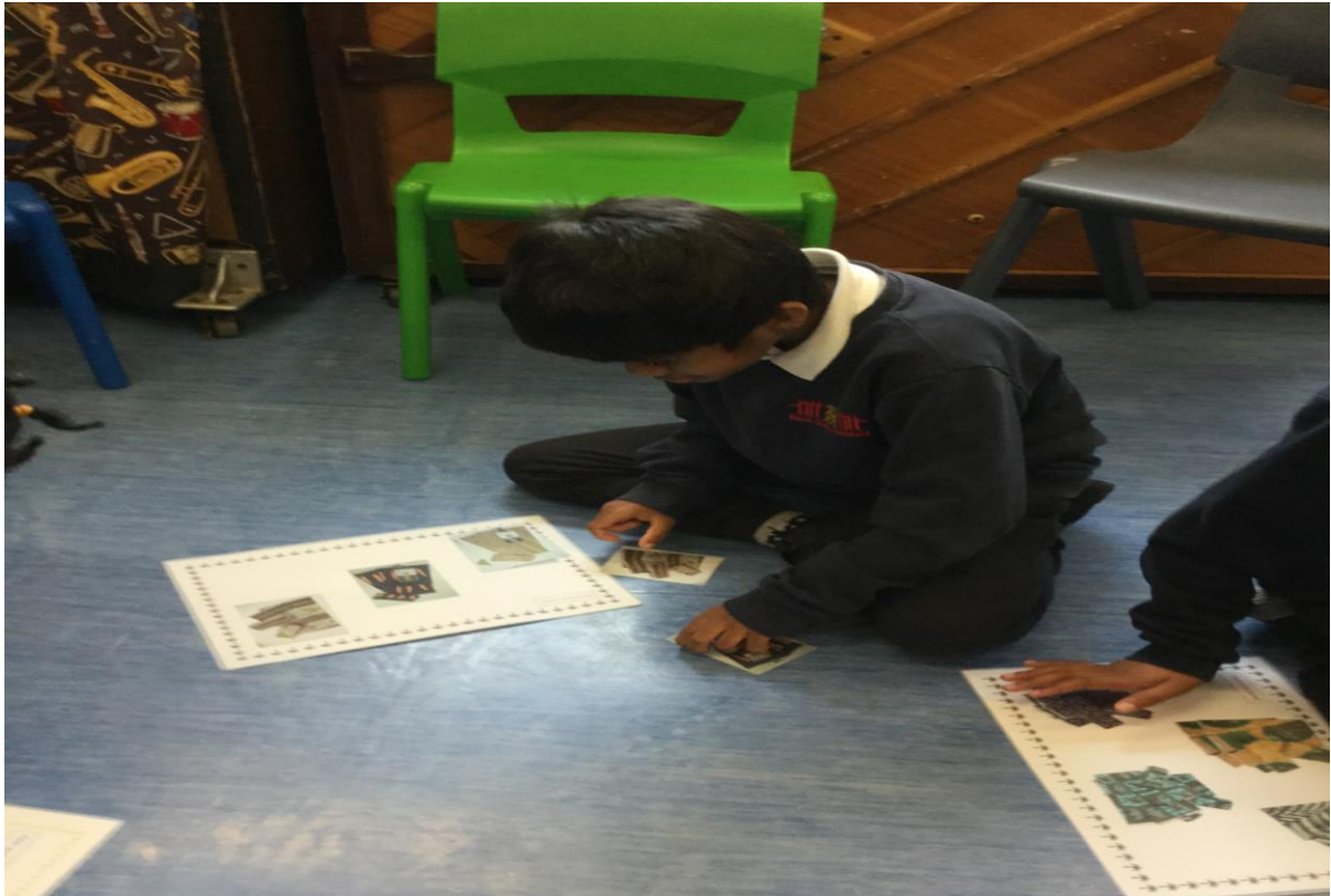
I am completing a matching activity independently: 'find the same'