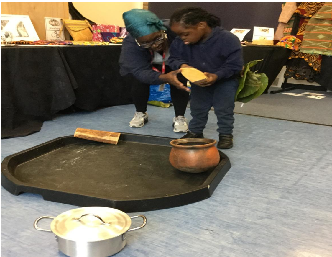
I am helping to carry some wood for cooking