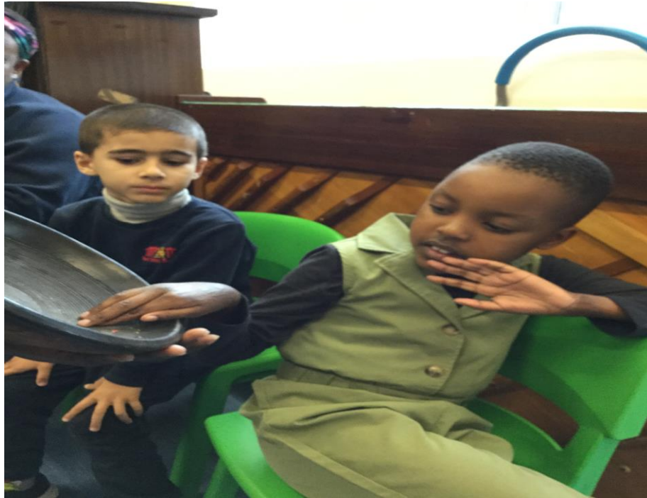
I am exploring the earthen dish: texture exploration