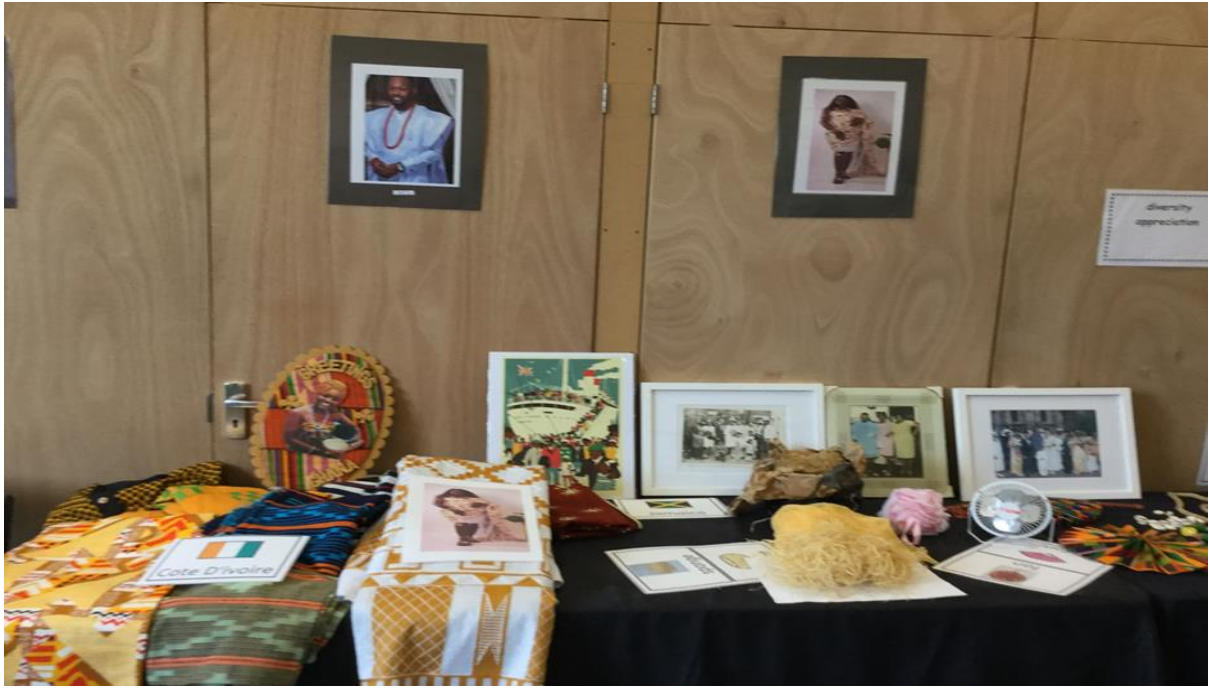
African fabric display and Windrush generation photographs (1967/1st, 2nd, 3rd and 4th generation)