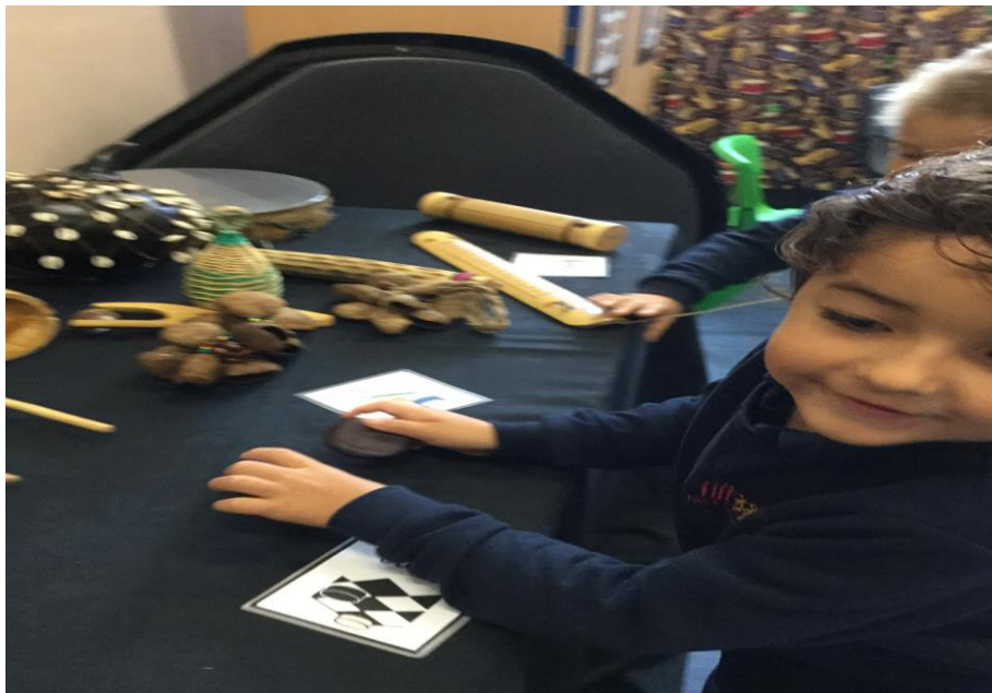
Children are exploring African Musical instruments