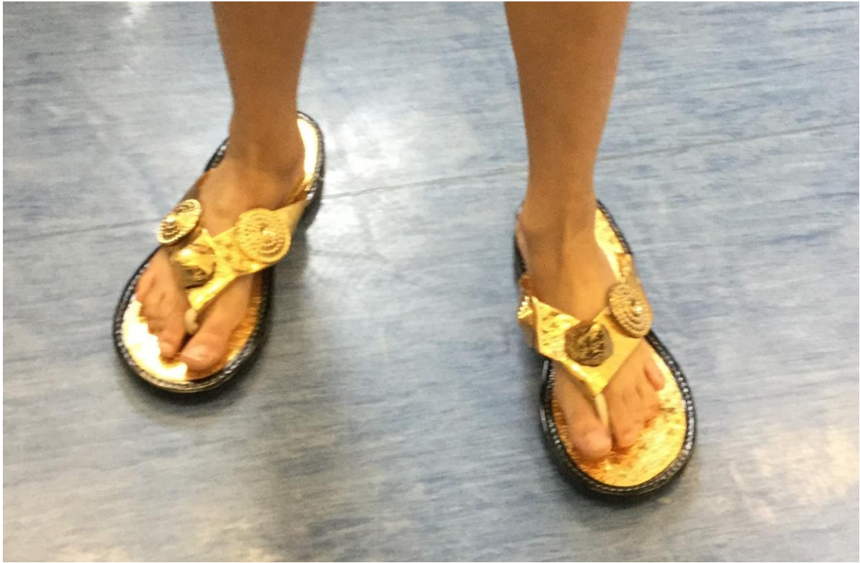
Modelling traditional African sandals from Ghana/Cote D'ivoire/Akan tribe.