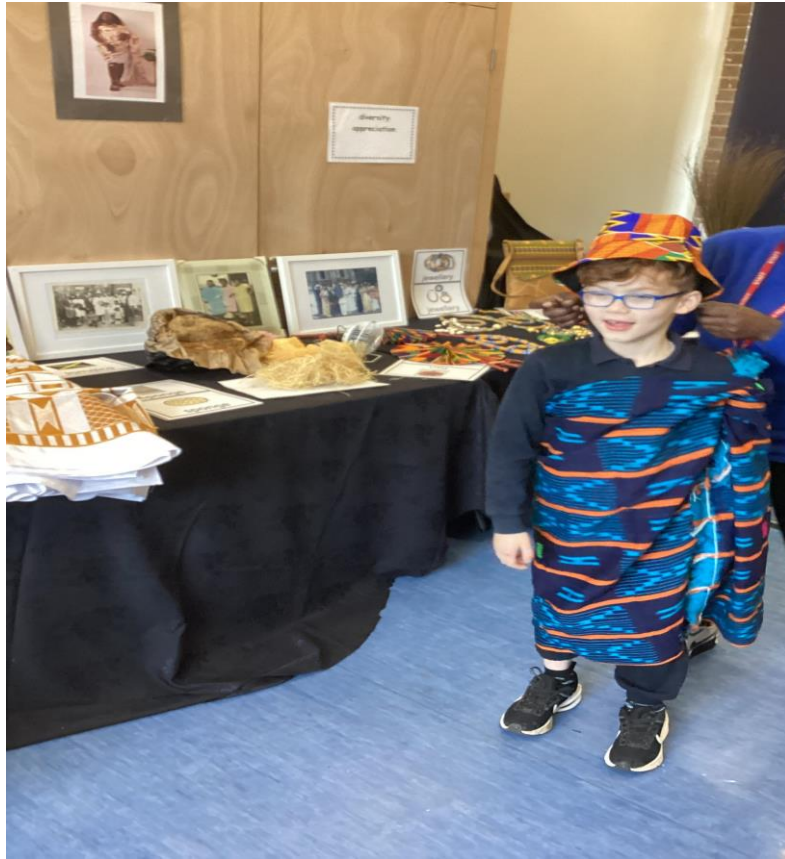
Dressing up: I am wearing a traditional African handmade fabric