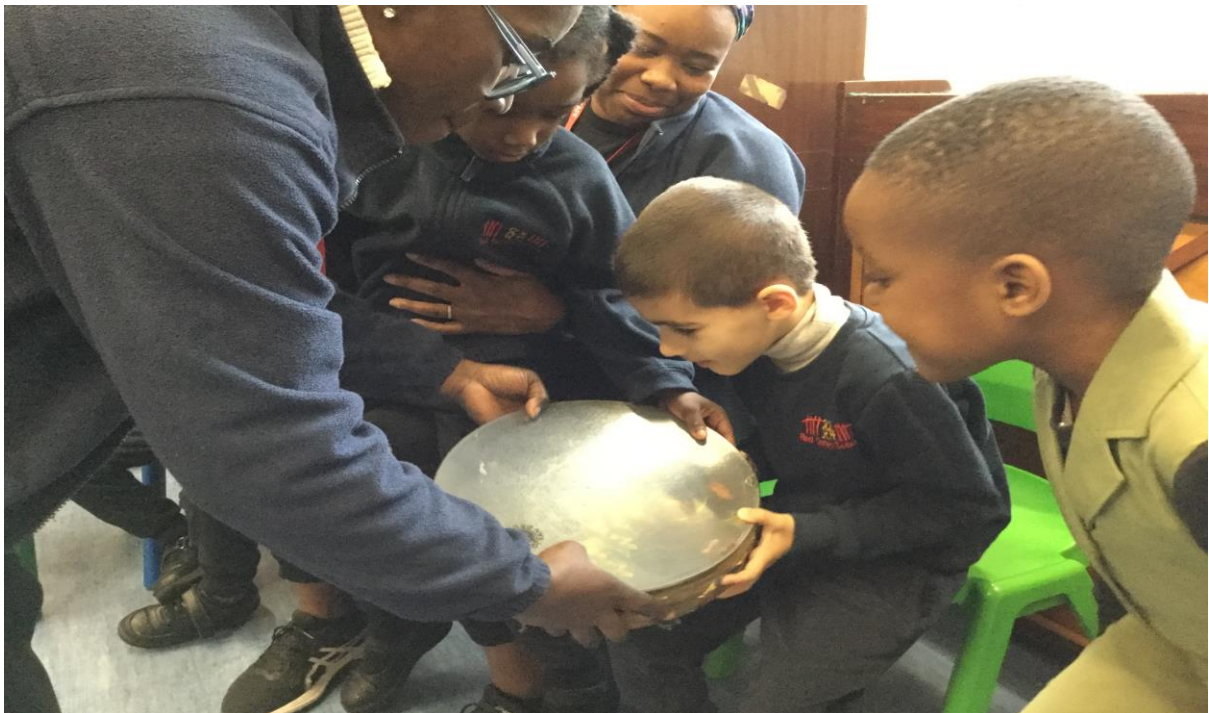
We are listening and eye tracking the movements of the beads inside the Ocean drum