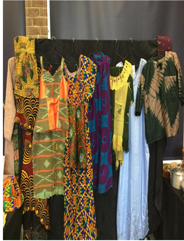
African clothing display