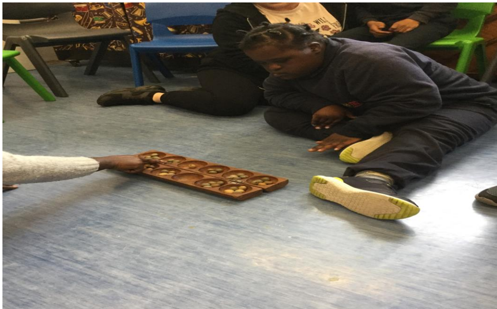
I am watching adult modelling 'Awale game'