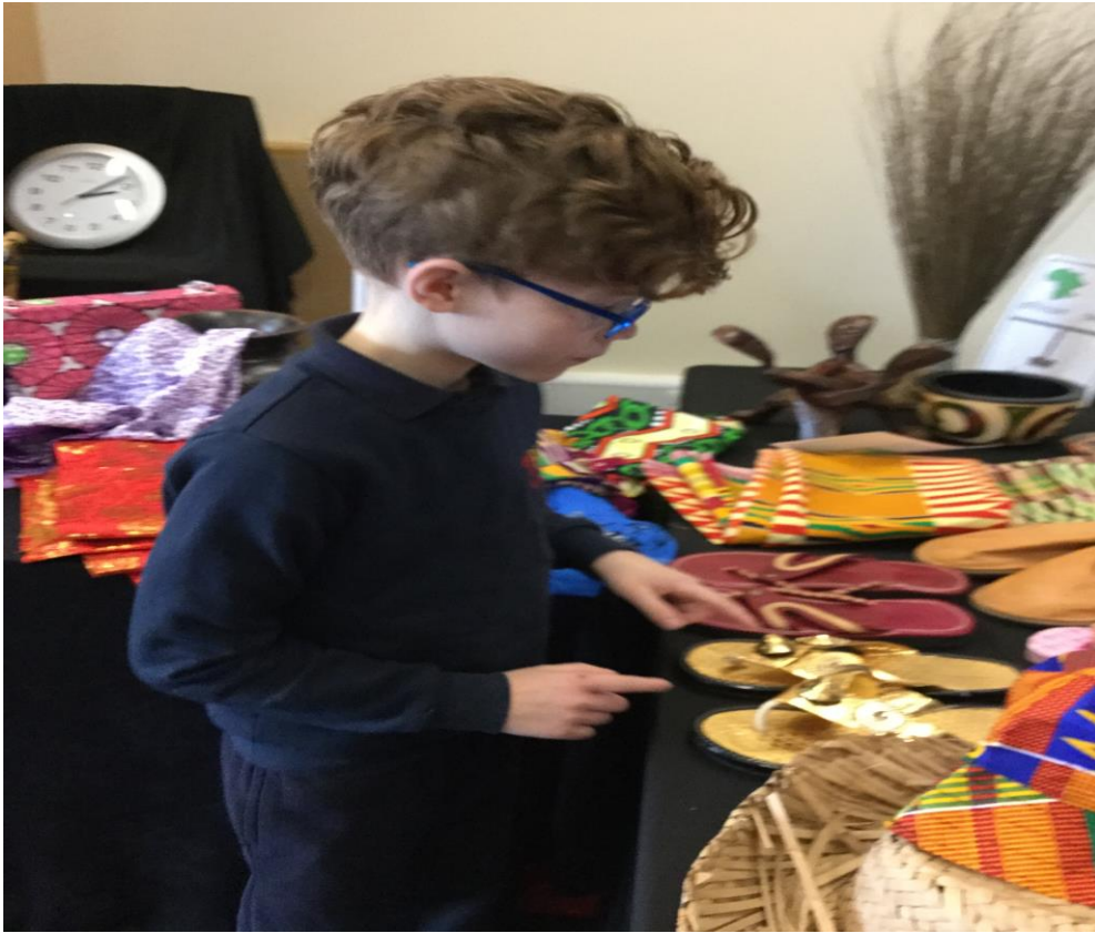
I am browsing at the display: Traditional African sandals (Ghana/Cote D'ivoire)