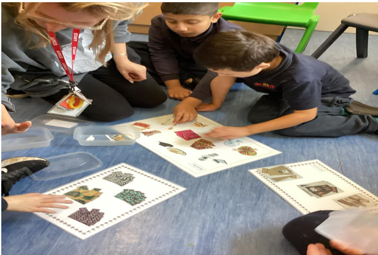
We are completing a matching activity: 'Find the same'