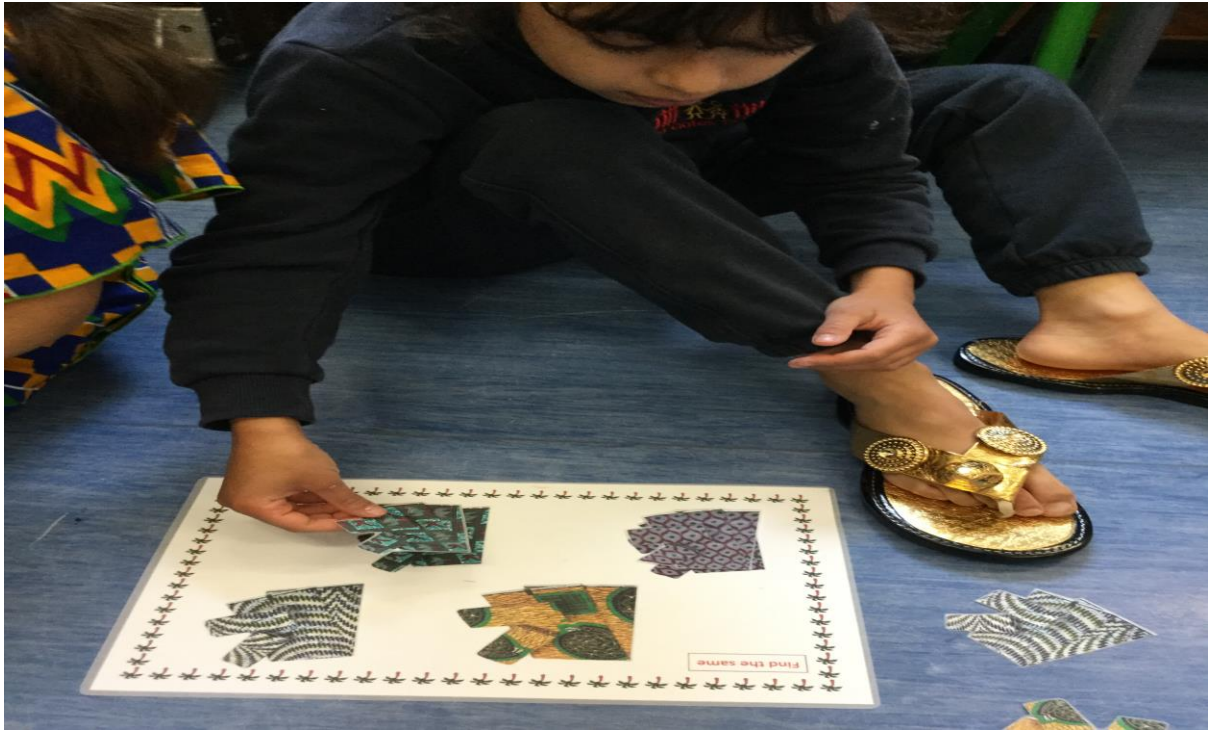
I am completing a matching activity 'find the same'. I am also wearing traditional Akan sandals