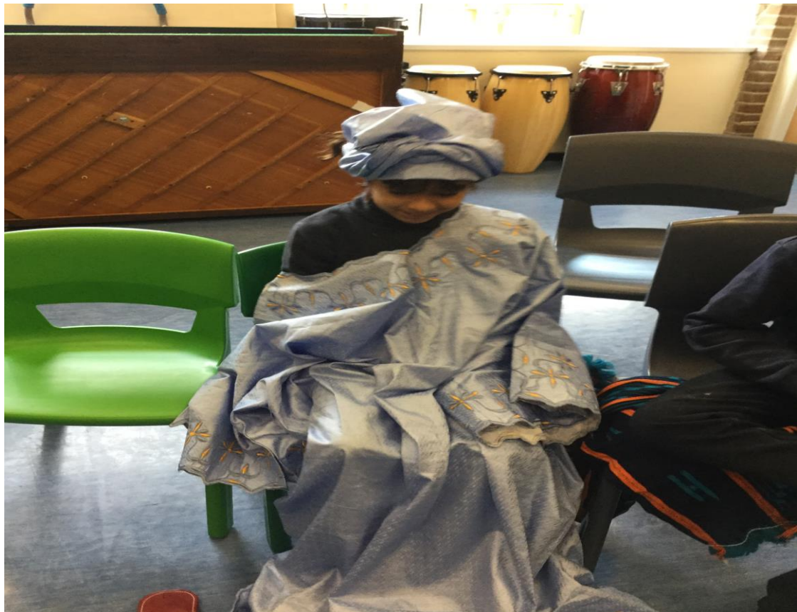
I'm wearing an outfit from Mali