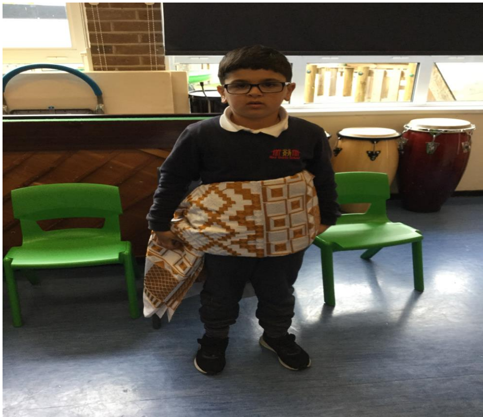
I independently wrap the traditional African fabric around my waist: Kente Ghana