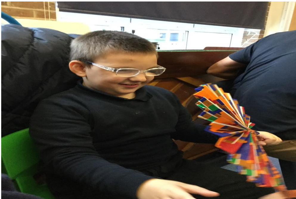
I am holding a fabric fan