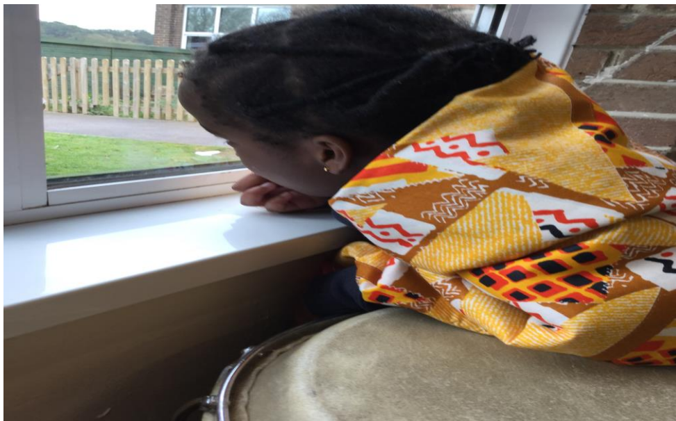
I enjoy wrapping myself up with the African print fabric