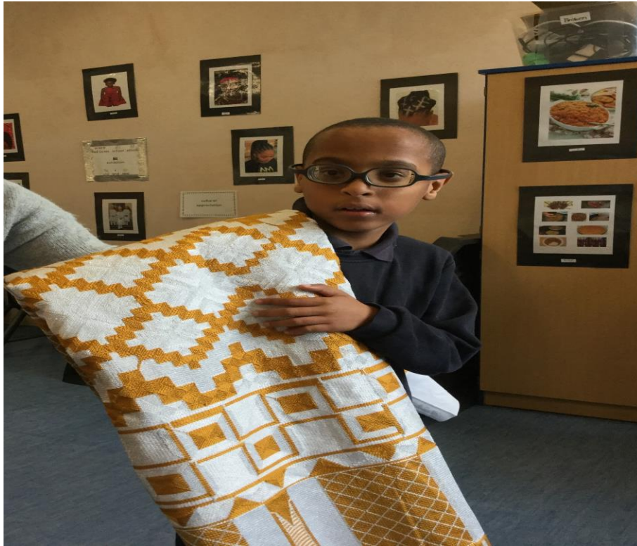
I am modelling the traditional African fabric 'Kente' from Ghana/Cote D'ivoire/Akan tribe