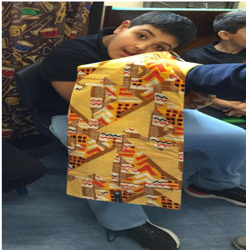
I am enjoying the softness of the African print fabric: texture exploration