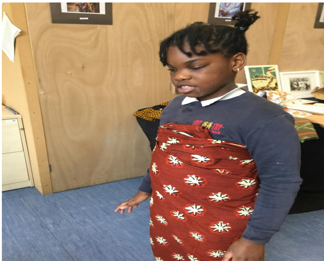
I am wearing an African print fabric: African Ankara