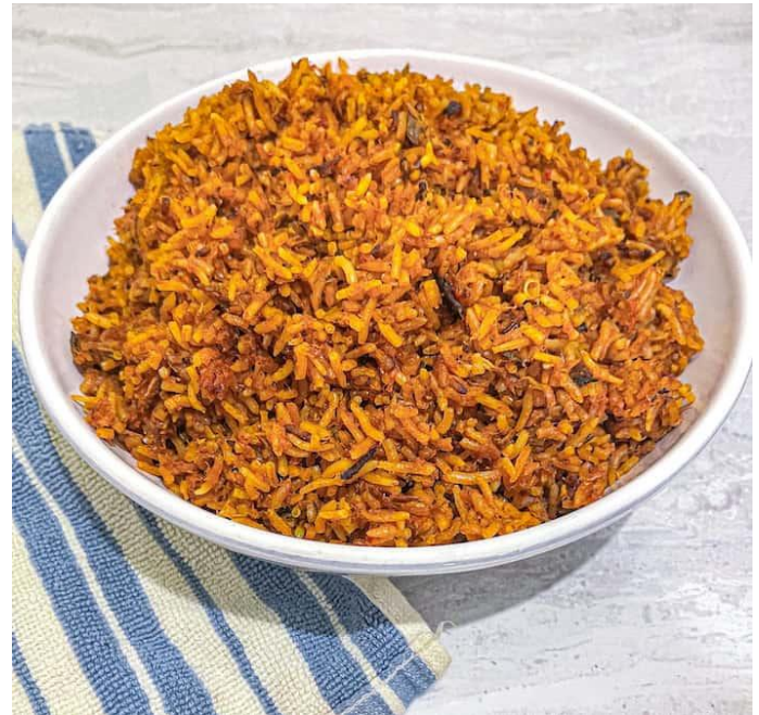
Taste of Africa: Jollof rice. A staff member kindly made Jollof rice for children and staff.