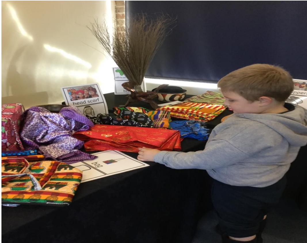
I am independently browsing at the display