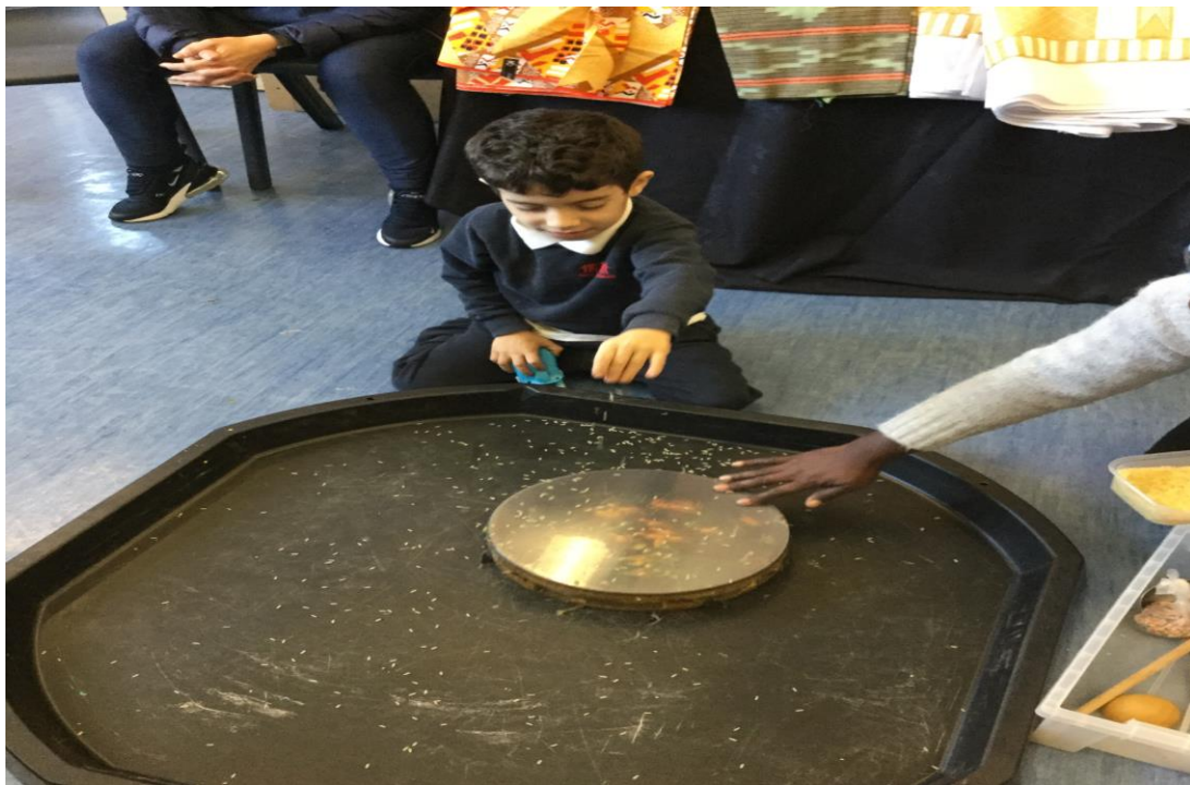
Ocean drum musical activity using rice.