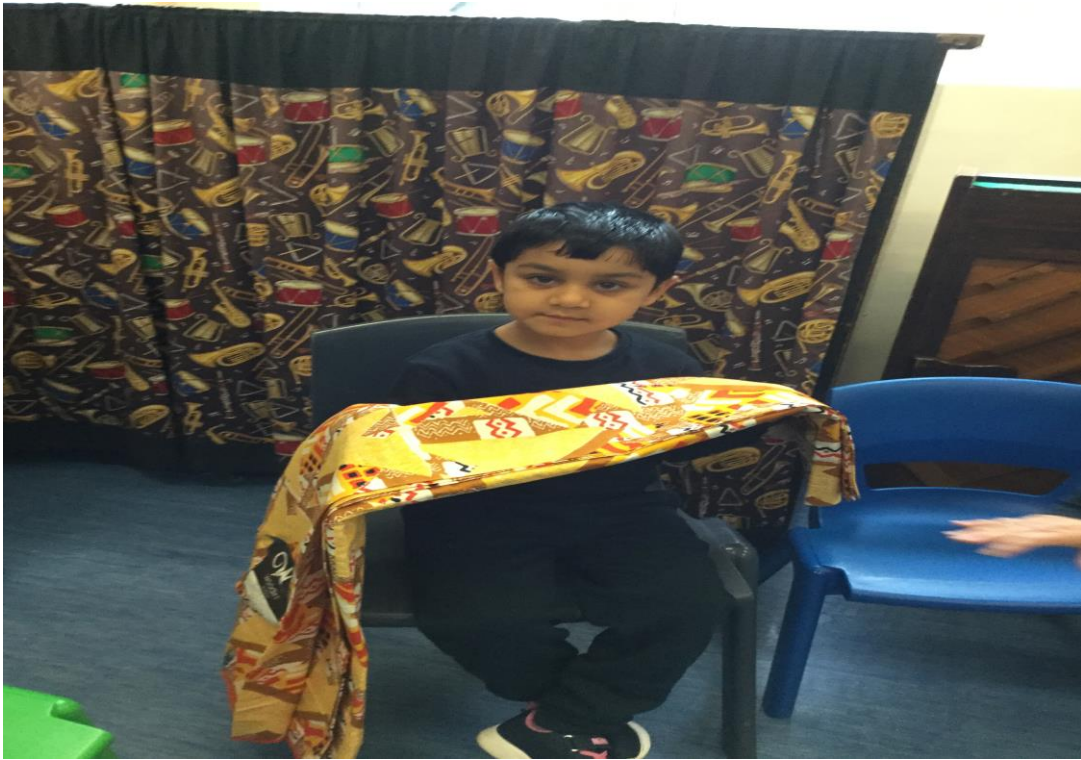
I am holding an African print fabric: African Ankara