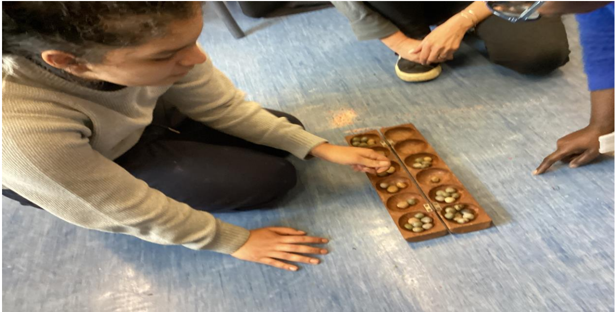
I am playing the 'Awale' game: a social game of counting and turn taking.