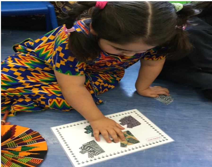
Dress in African print dress and completing a 'find the same activity'