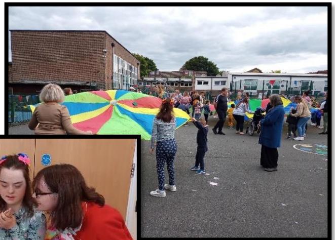
Parachute Games in the Playground