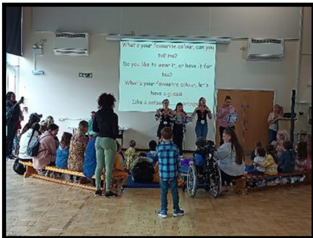
Sing and Sign in the Hall

This year's event will see even more going on, including 'bring a picnic' and some fun fundraiser stalls. We're changing the name to 'Red Gates Fun Afternoon', but there will still be lots of colour and bubbles! We look forward to seeing you there on Sunday 24 th September.