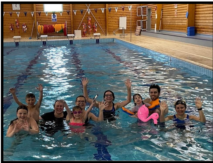
FORGS' FANTASTIC SPONSORED SWIMMERS

For the first time since the pandemic, we were able to run our popular Christmas tombolas, grand raffle, and cake sales - wow! Your children all did so well during the performances and it was such a joy to see all our lovely families and carers coming together again. Thank you to everyone for your wonderful and generous donations of raffle prizes, toys books and games, and for buying tickets and cakes. You'll be pleased to know we raised over £360 in those three days - well done everyone!